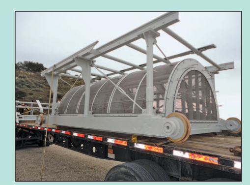
Newly refurbished intake gate assembly arriving ready to be returned to service.