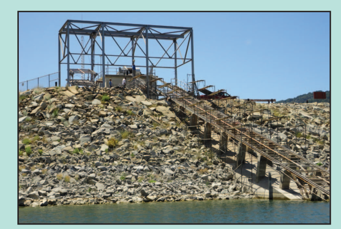
Setting up scaffolding for recoating of dam's hoist house equipment and intake track.