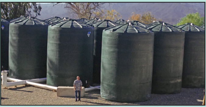
Neil Cole, Principal Civil Engineer stands in front of 16 temporary water tanks to be used during work on Upper Ojai Reservoir tank.

How do you complete work on the only water tank in a service area and keep customers happy by keeping their water running? Casitas' answer is to use temporary water tanks! Casitas is planning to avoid any interruption in water service to customers in the Upper Ojai Valley while completing interior painting and seismic improvements on the Upper Ojai Reservoir tank. The temporary water tanks will provide the necessary water storage during the work. After this work is complete, the temporary tanks will be used during future reservoir maintenance activities.